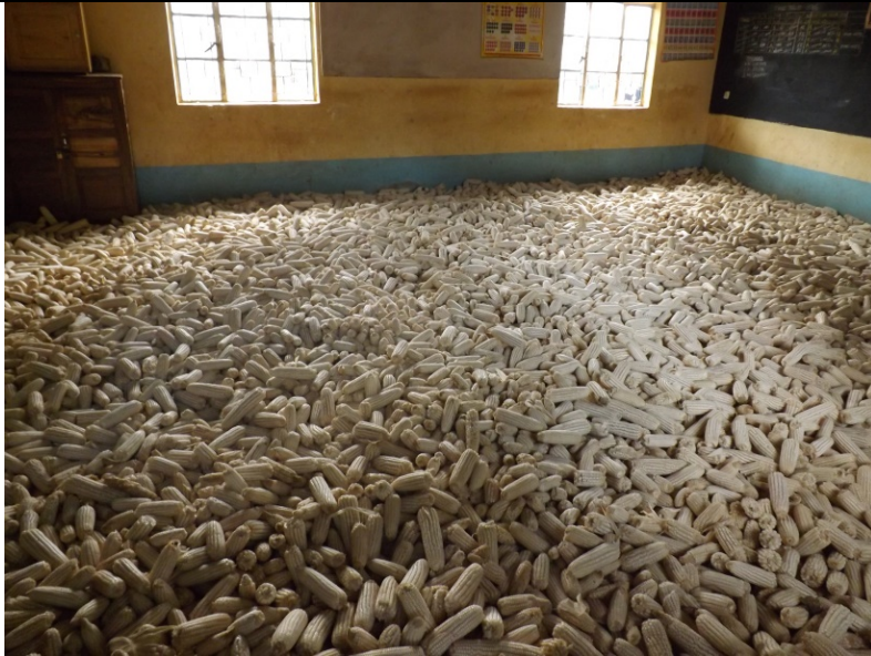
A good maize harvest at Buchenya primary (August 2016).