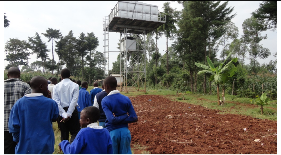
Water tanks/community water-point in Musaa primary. Access to water is important for successful gardens especially during drought.