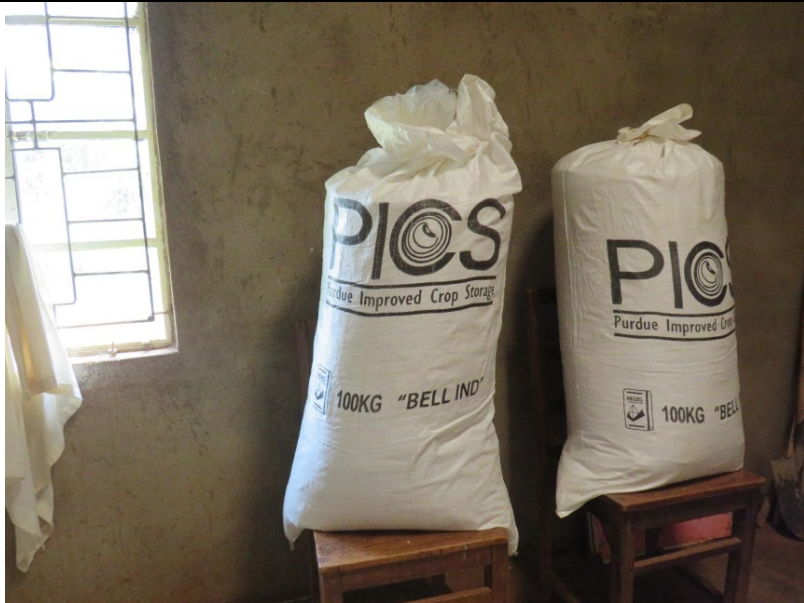
Hermetic storage of maize in Matioli primary (October 2016).