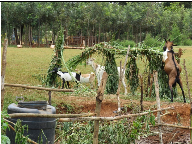
4H club at Shisango keep goats. They bought an improved breed which gives birth to twins every time, therefore they are able to increase their herd quickly.