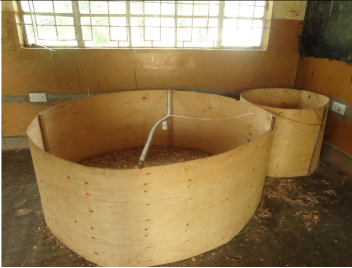
Chicken brooders at Nyanginja primary school. The school keeps over 100 free range chickens and sells to the community.