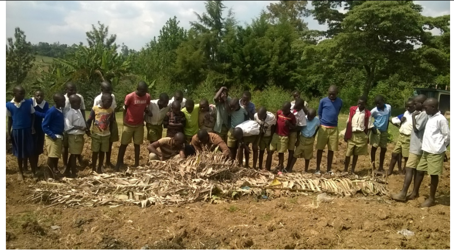
Ituti primary 4K club students inspecting a tomato nursery with their teacher. Club members get a seedling each to plant at home.