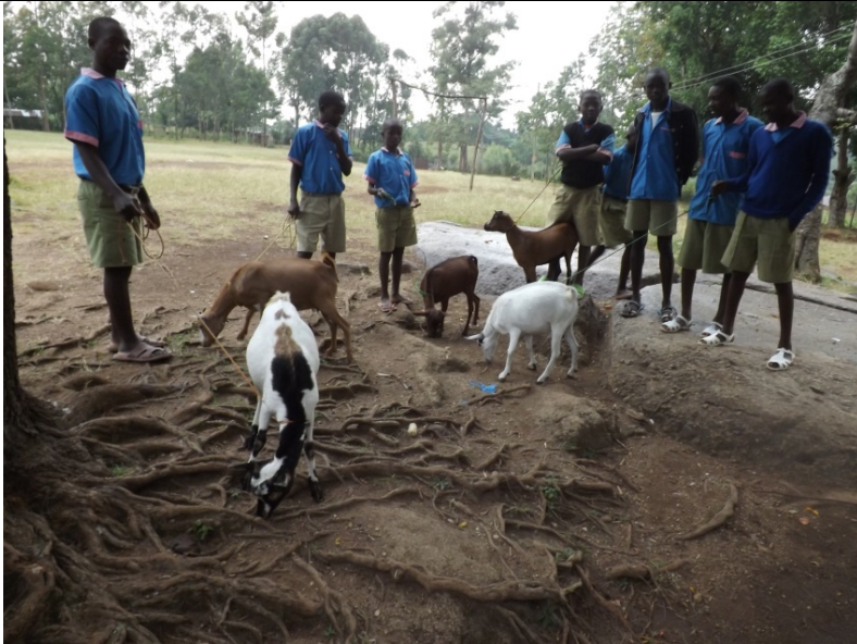
Eshikomere primary 4H members with goats. The school is on rocky ground unsuitable for crop farming.