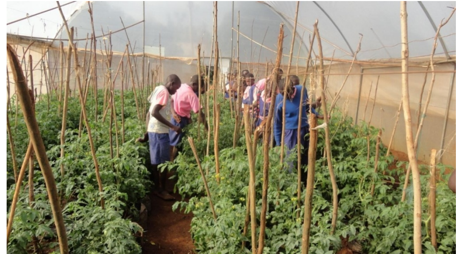
4H club members at Nyang'anga Primary pruning tomatoes in their greenhouse.