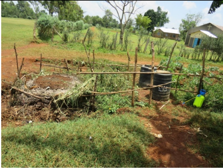
Organic manure at Shisango primary. The black tanks contain a foliar feed that club members make from goat droppings, pepper and Tithonia.