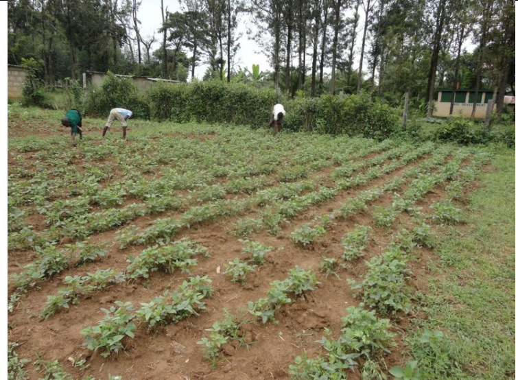
Eshibimbi primary 4H members weeding the vegetable garden.