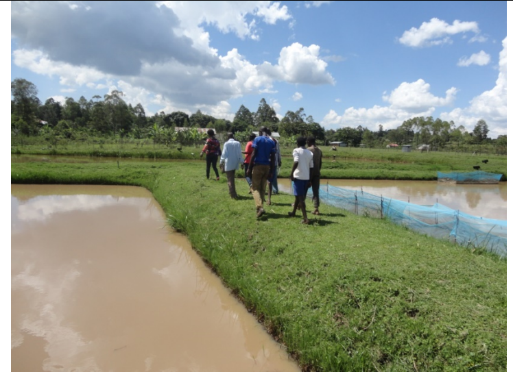
Tatro primary used 4H funds to expand the fishpond project initially started Millennium Villages Project. The school supplies fingerlings in the commun