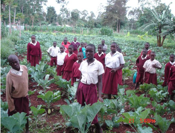
Nyamninia primary 4H members in 4H vegetable garden.