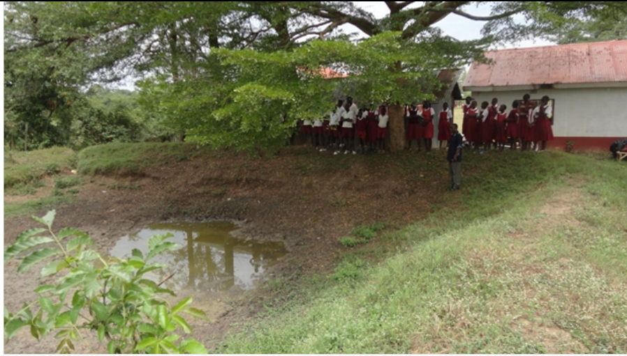
Fish pond at Pap Olengo primary dried up due to prolonged drought.