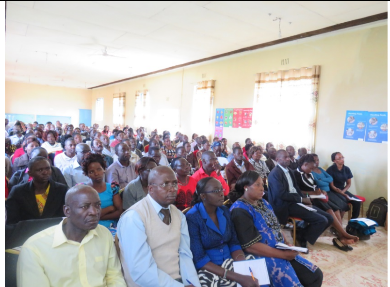
Teachers' training workshop in Kakamega (2016) in partnership with Nestle Healthy Kids.